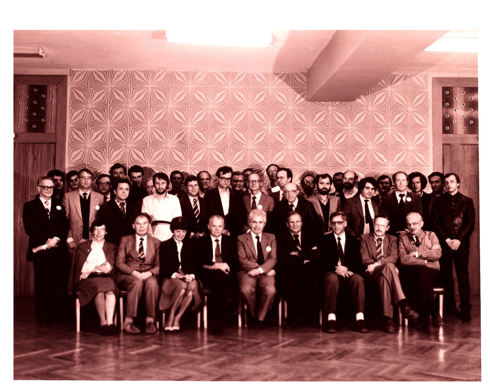
Soviet-German Symposium on Excitable Membranes, Kiev, 1983